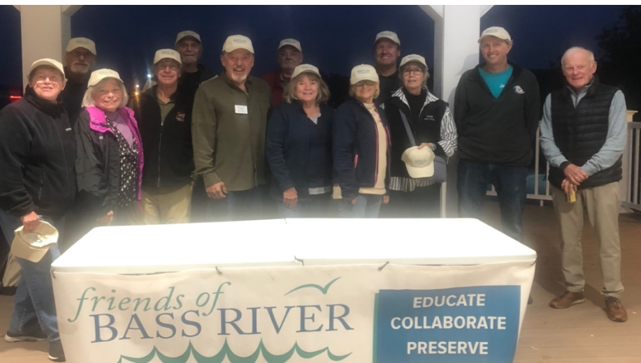
Our Volunteers are the lifeblood of Friends of Bass River